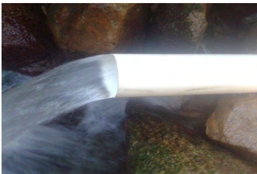
Water flow from the dam