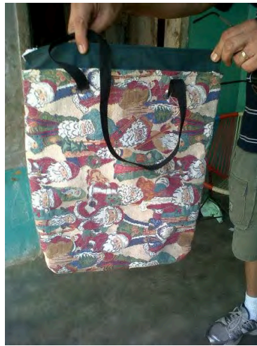
Material for purse maker