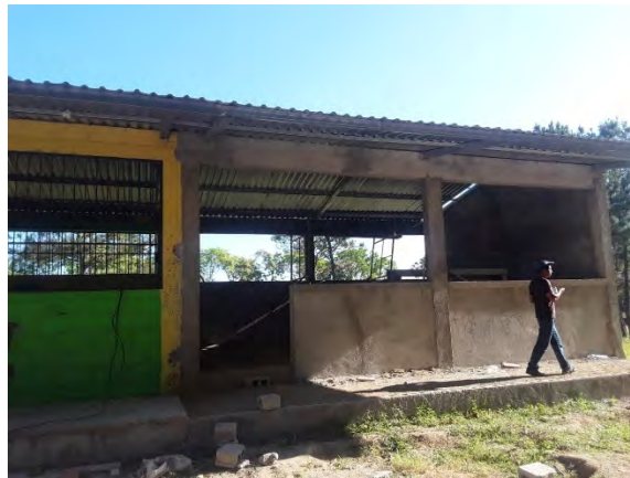
The second classroom