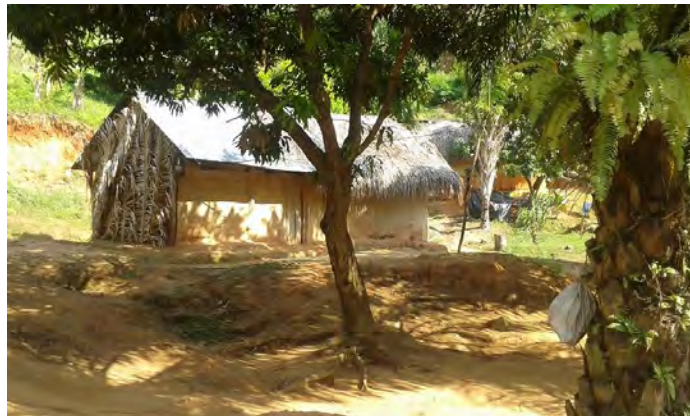
Metal and thatch roof house

Replaced thatch rooves over bedrooms with metal