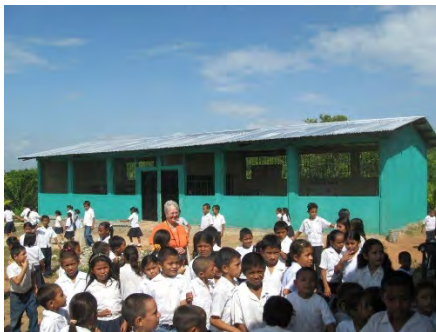
The new classrooms