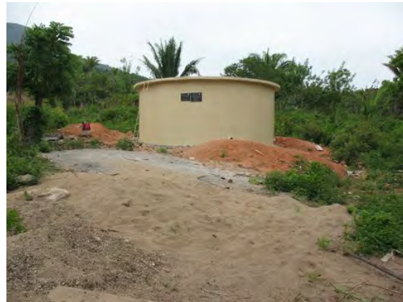
The new river water tank