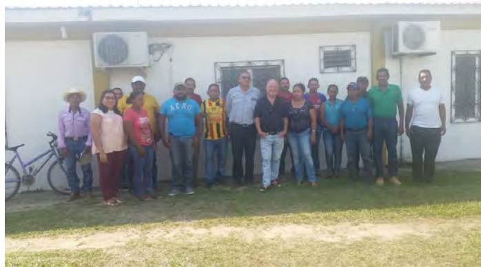
Rigores water board

The Rotary Foundation approved $110,000.00 to fund a water system to provide clean water to the communities of Rigores, Las Uvas, Nueva Vida, Ilanga Viejo and September the 18 th . This will serve 5000 people in 872 houses. The initial plan called for a 350' deep well. A hydrogeological study found that it would not provide the necessary 120 gallons per minute needed. A new plan is being developed that will incorporate numerous shallow wells and tanks