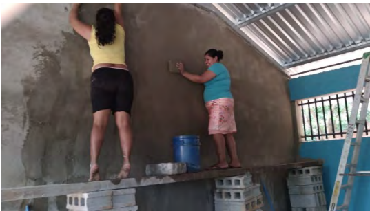
Plastering the classroom