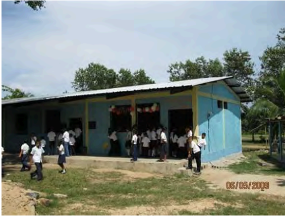
The new classroom

Built a new classroom and 3 new latrines at the school in Rio Claro and donated computers