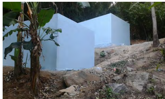
The filter and river water tanks