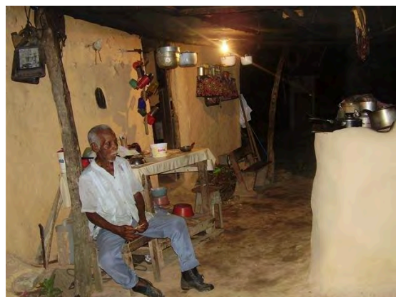
A home with electricity