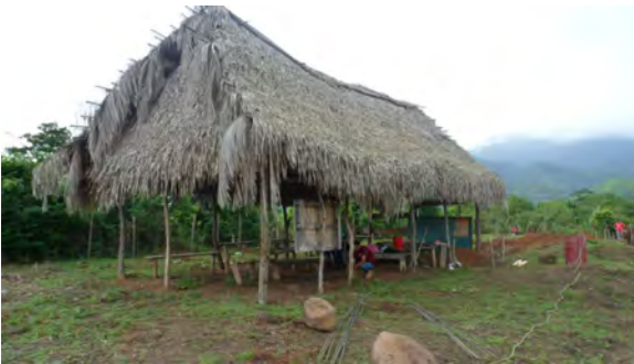
The old classroom, 3 teachers

Replaced an open air thatch, one classroom school with a 3 classroom school and latrines. Brought electricity to the school. Bought 65 new desks for the students and gave the director a new desk.