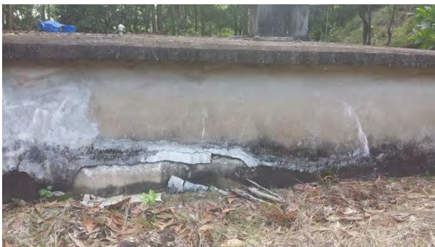
Existing 45000 gallon reserve tank