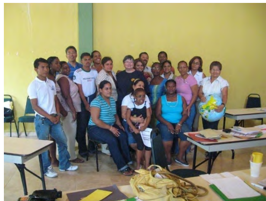
The participating teachers