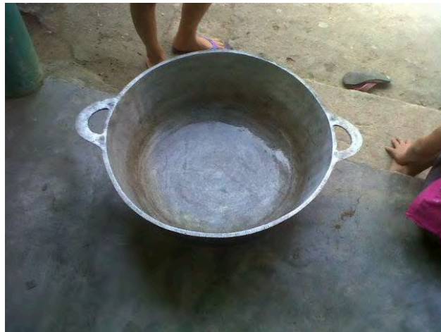
Tamale making equipment