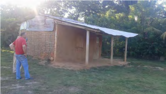
The original adobe school

Replaced a one classroom adobe school serving 6 grades with one teacher