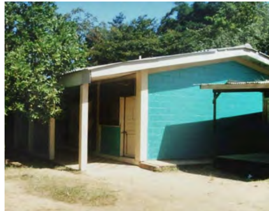
A repainted classroom