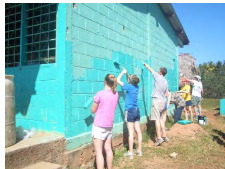
Painting the old classrooms