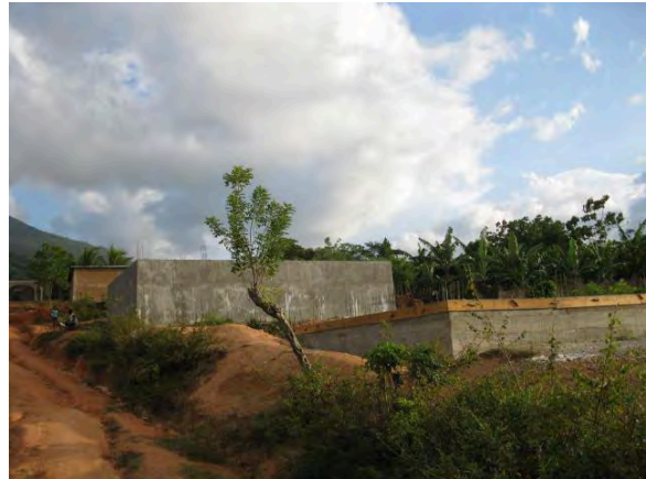
All three tanks