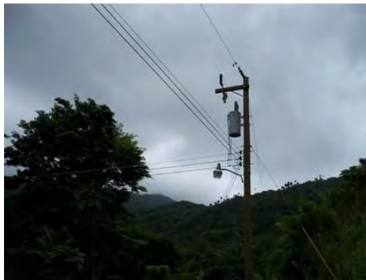
Power pole with transformer

Provided electricity to the 15 homes, cultural center and schools