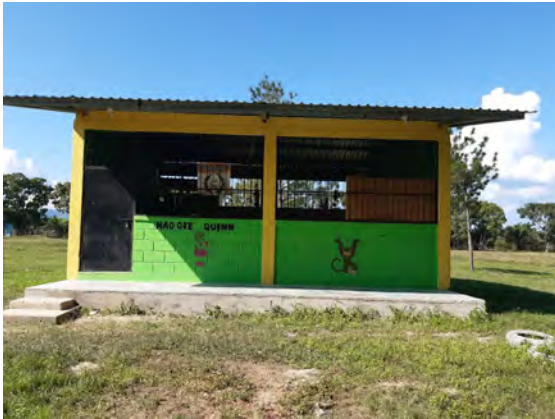
The new kindergarten