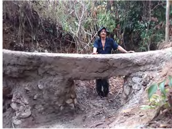
Pipeline over a ravine