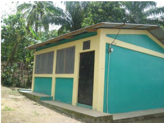
The new kindergarten