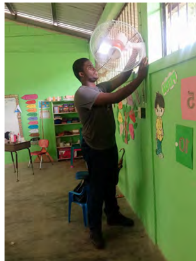
Installing fans and fixing electricity