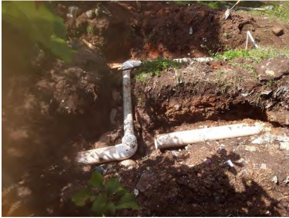
Connecting main tank to reserve tank where