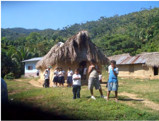
The old kindergarten

Replaced an adobe and thatch kindergarten