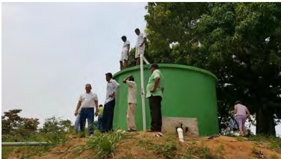
The new tank

Built a new water tank and connected to the dam