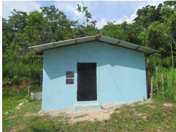
The new kindergarten