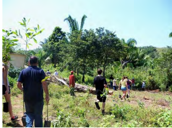
The donated trees transported by army