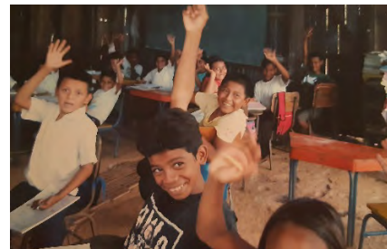
Interior of old classroom