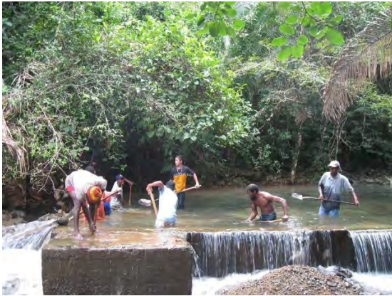
Cleaning the old dam

Cleaned and repaired the dam, built a river water tank