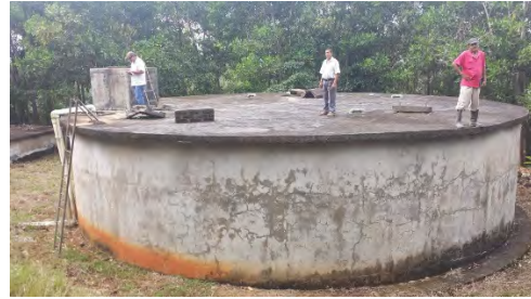
Existing 90000 gallon tank