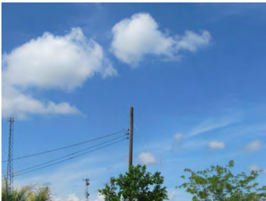
The power line to the school