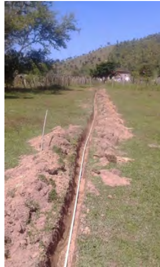
Waterline to the latrines