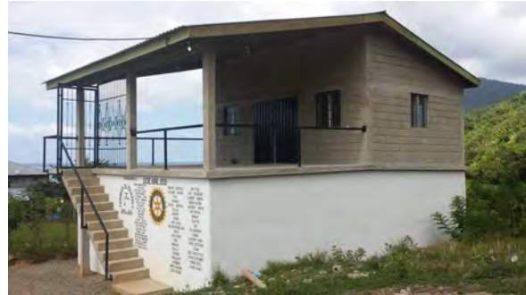
The 54000 gallon tank