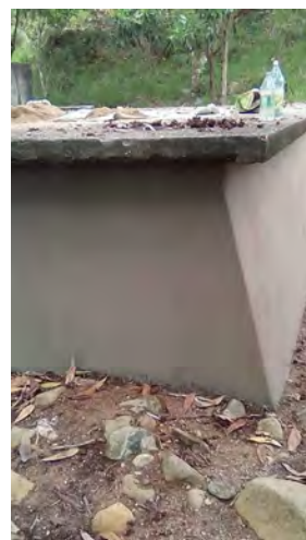
Repairs to reserve tank