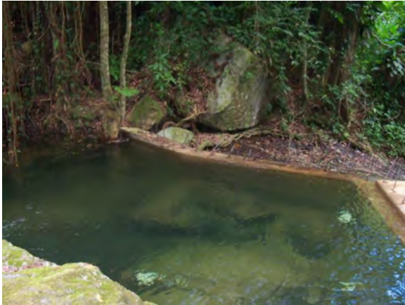
The second dam

Built a new dam (their second) and a 42000 gallon river water storage tank. The community provided the tubes.