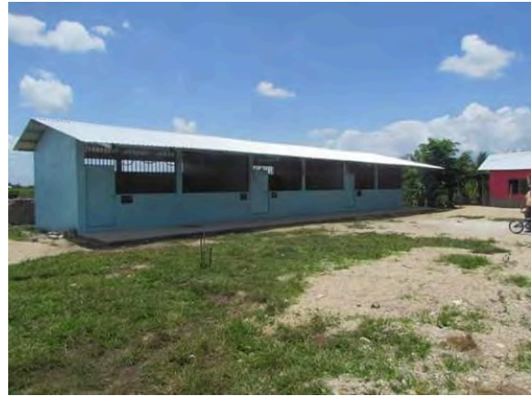
The new school