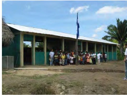
The new school