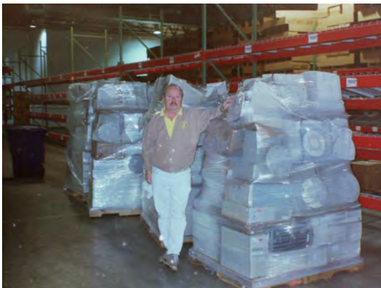
Computers in Vermont

Delivered a portion of 153 computers to schools in Cunda, April the 18 th , Remolino, Barrio San Martin, United Nations School and Kinder Bendick (Barrio Buenos Aires), June the 13 th , Moradel, Community of the Tigers (laptops), the Trujillo library, Rio Claro and Guadalupe Carney. The remainder went to schools in Atlantida.