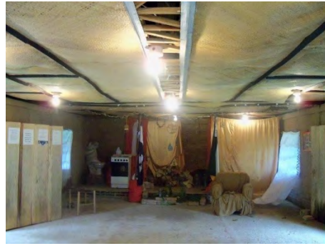
The cultural center