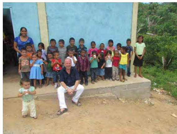
With the kids