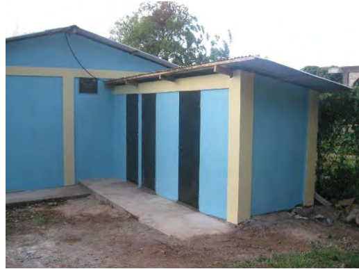
The new latrines