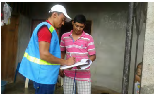
The health worker visiting homes