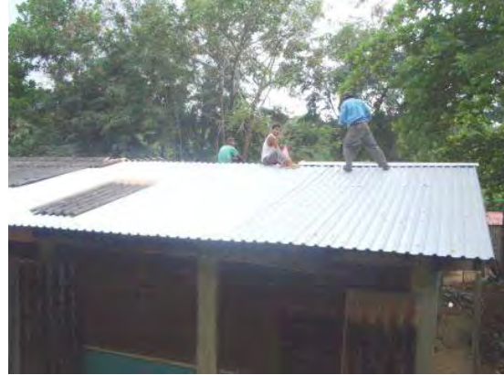
The new roof