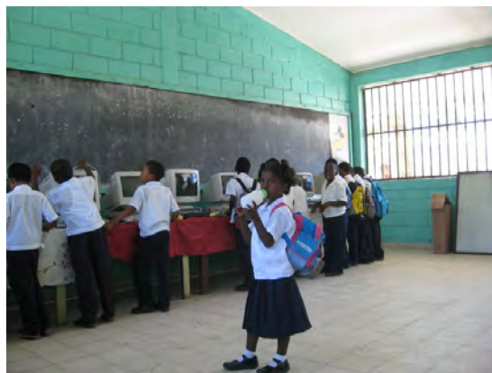
At the school in Barrio San Martin