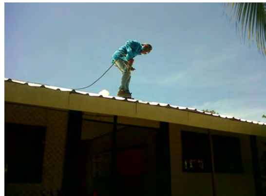
Repairing the roof