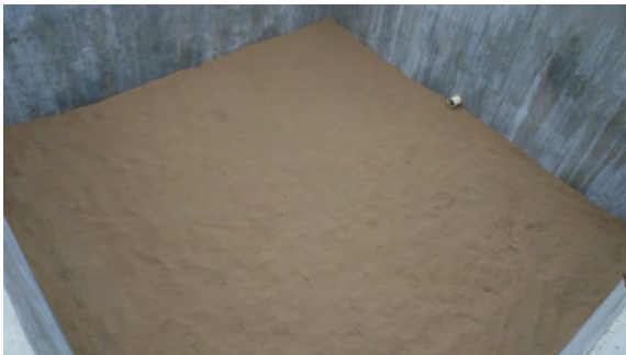
The sand in the filter tank

Rotary District 5890 built a slow sand water filter tank