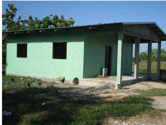
The first new kindergarten

Constructed the first kindergarten classroom serving 65 students