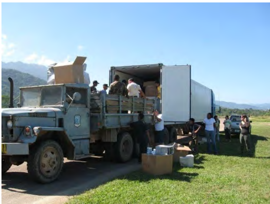
Computers arriving in Trujillo