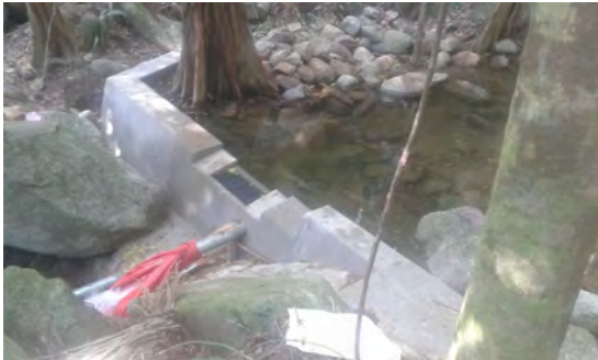
The new dam

The Rotary Foundation provided $102,475.00 to build a new water system for the 3000 people living here. The community provided the labor.