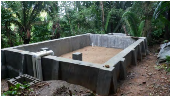
The slow sand filter without water

Constructed a water filter tank with sediment filter