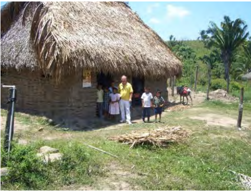
The old school

Replaced old one classroom adobe and thatch school with 3 new classrooms and latrines