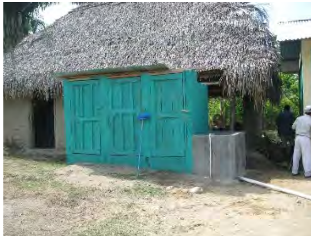
The new latrines