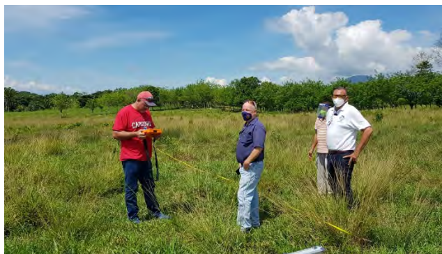
During the hydrogeological study