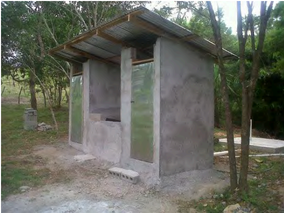
The new latrines

Added latrines and brought water to Kinder Tom Plumb