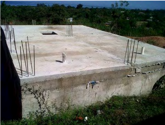
The clean water tank