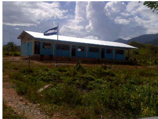
The new school