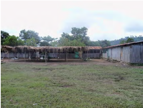
Original 8 classrooms

Built two classrooms (replacing old barnboard classrooms) and 3 latrines