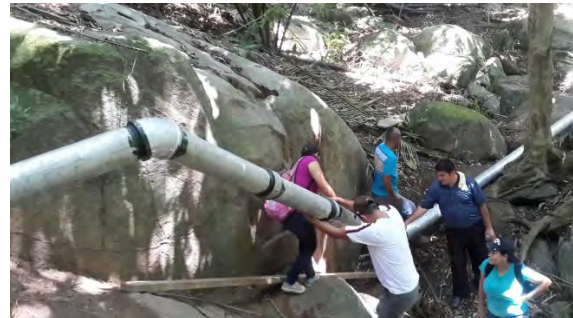
Installing 1.8 miles of pipeline