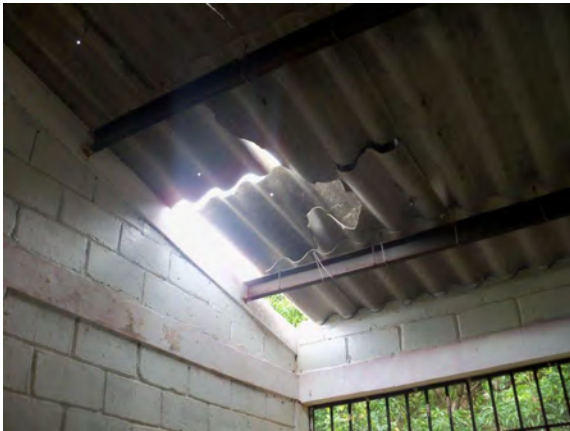
The leaky asbestos roof