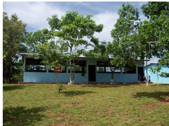
The two new classrooms