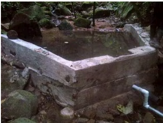
The new dam

The Rotary Foundation provided $136,300.00 to construct a water system serving the 1128 families in 8 villages. The community provided the labor.