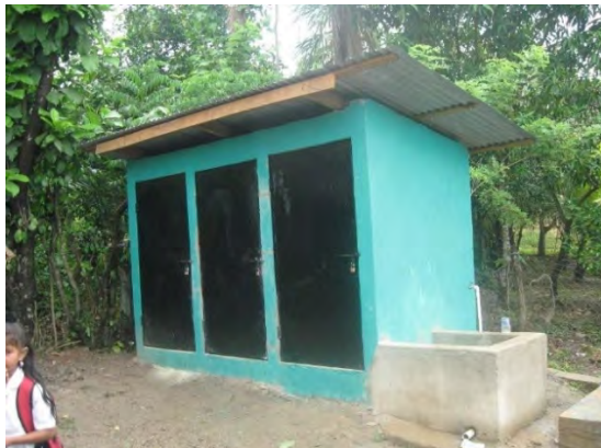
The new latrines