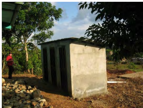
The new latrines