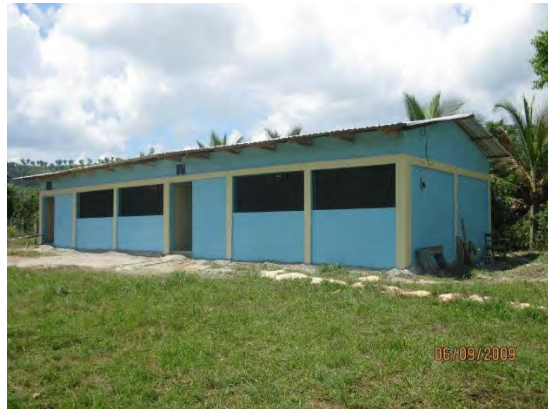
First 2 classrooms, 2009