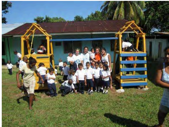
The new playground equipment