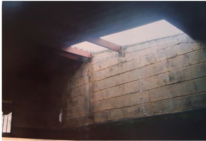
The leaky roof

Provided roofing materials for the school in Colon