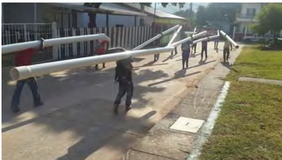
Carrying pipeline up the mountain