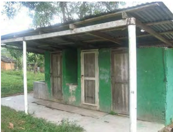
The old latrines