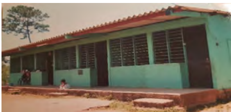
Rewired these old classrooms