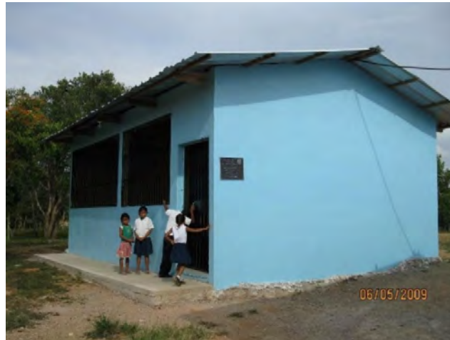
The first new classroom