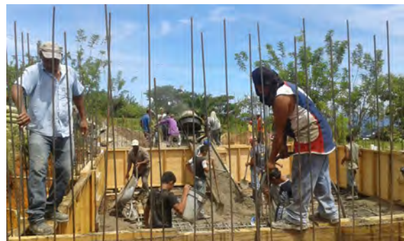
Constructing the 54000 gallon tank