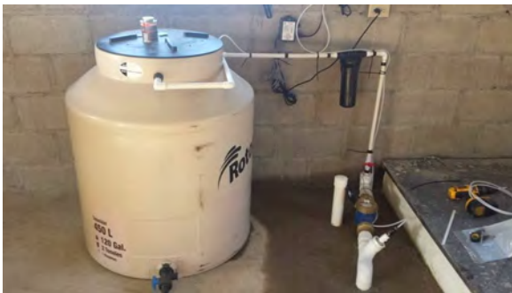
The chlorination system