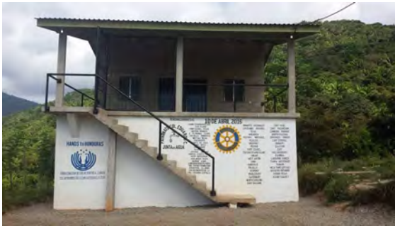
The 54000 gallon tank