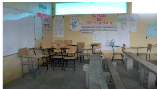
Old desks and regular desks