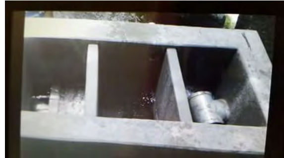
The sediment filter