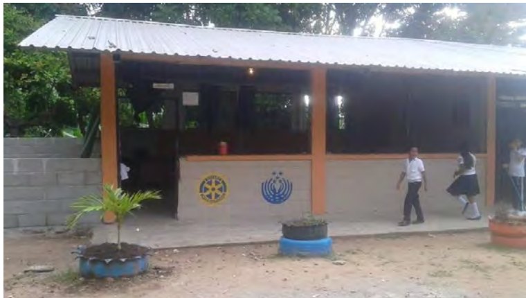
The new classroom

Added a classroom to the school in Barrio Capiro due to overcrowding