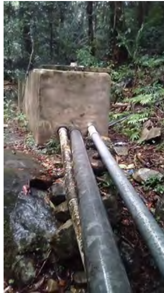
The sediment filter