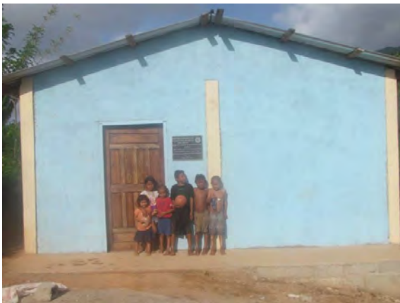
The new kindergarten