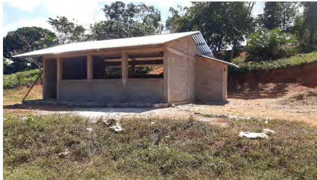
Kinder Ken McCauley under construction