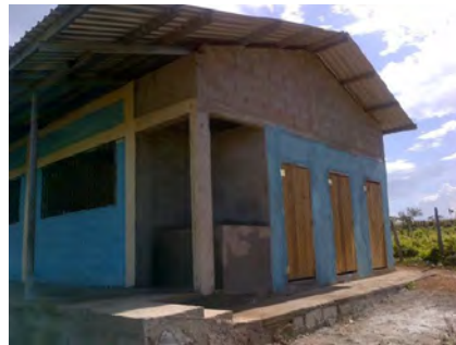
The latrines and pila