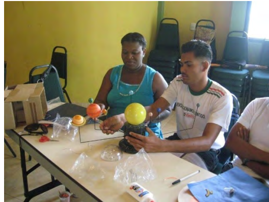
Science Equipment training