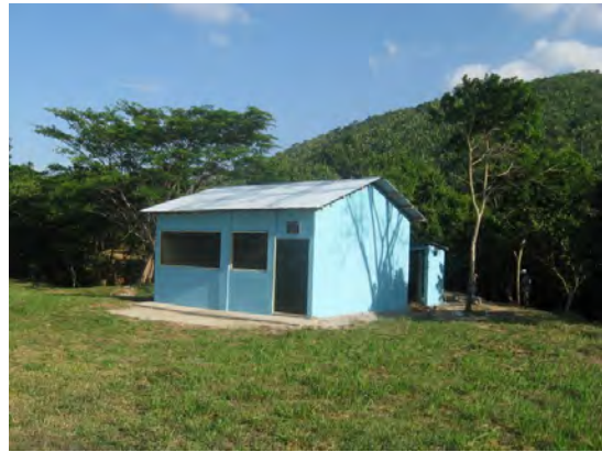
The new kindergarten