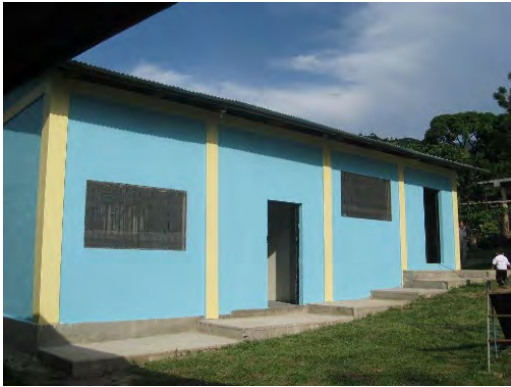
The two new classrooms

Built two additional classrooms with latrines and playground equipment