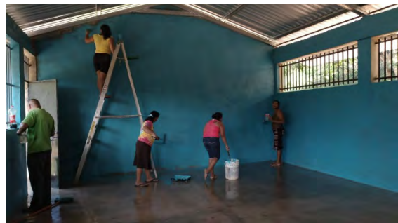
Painting the classroom