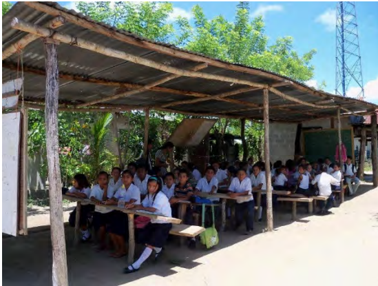
The old school

Built a 3 classroom school replacing an open air school serving 165 students and brought electricity to it