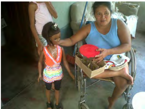
Used clothing sales