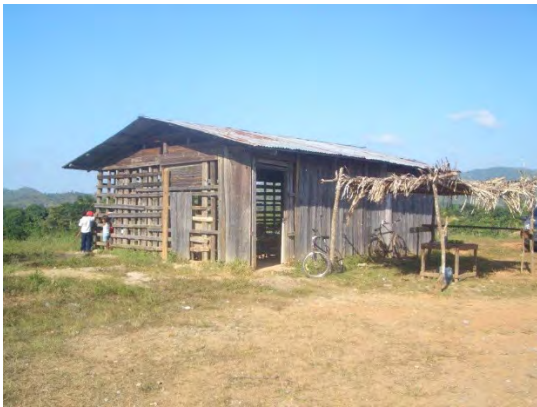
The old school

Brought water to the site and built latrines