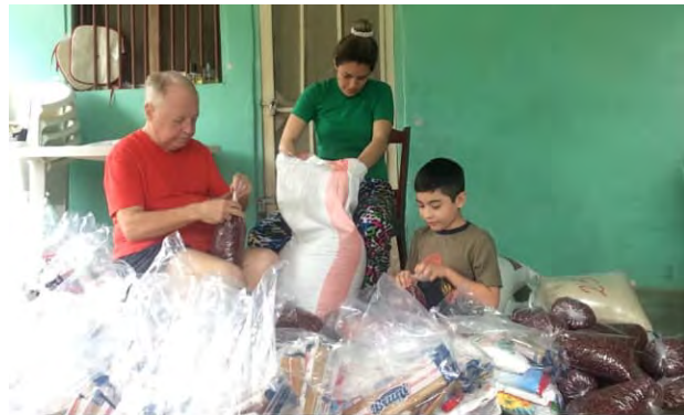
Bagging the food