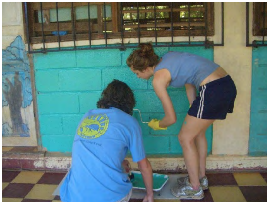
Painting the school