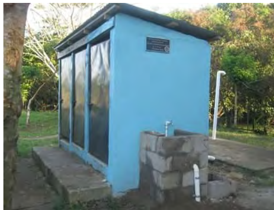
The new latrines