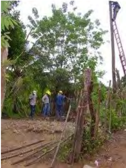
The power company