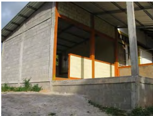
The new kinder classroom

Added a second classroom to the kindergarten