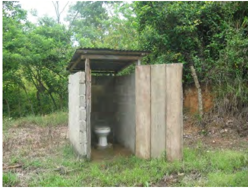
The old latrine

Replaced an old latrine with 3 new ones including septic