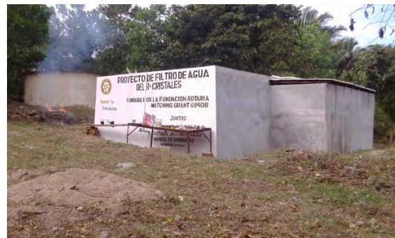
The slow sand filter tank