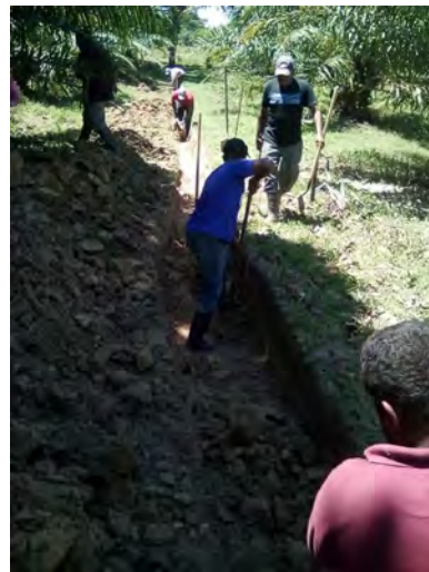
Trenching 12 kms of pipeline