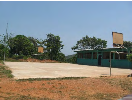
The new playground