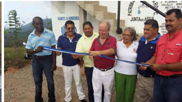
The ribbon cutting April 2016