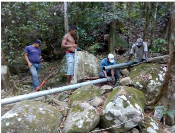
Laying pipeline above ground