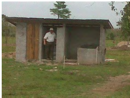
The new latrines