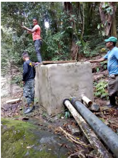
The pressure breaker