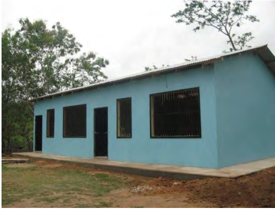
The two new classrooms

Built 2 additional classrooms and repaired septic system