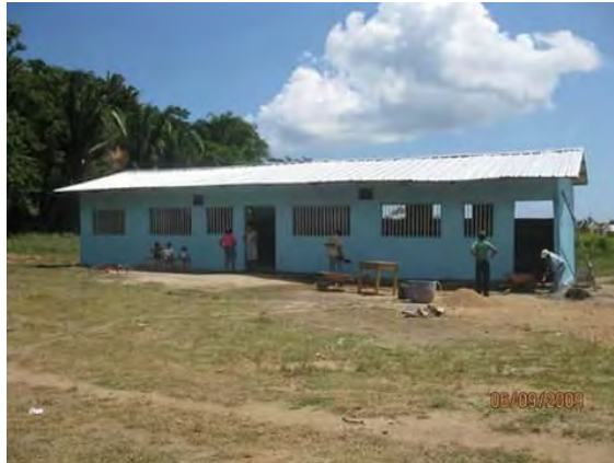
The new elementary school