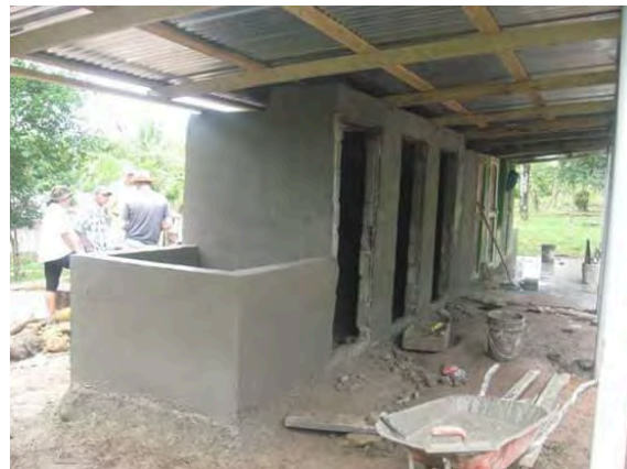
The new latrines before painting