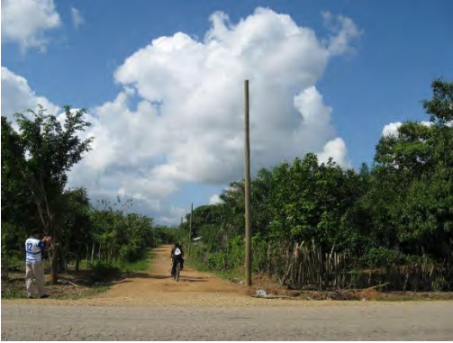
The new power poles

Provided electricity to the 30 homes and school