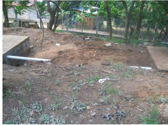
The repaired septic system