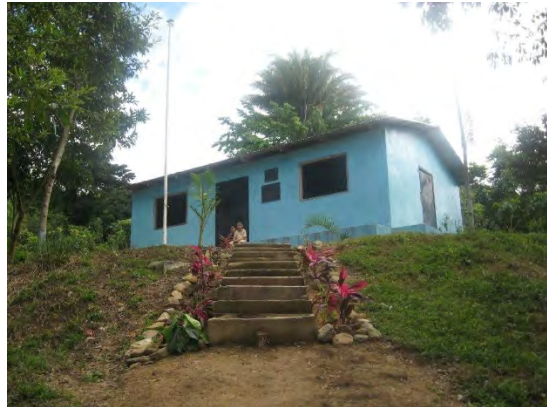
The new school