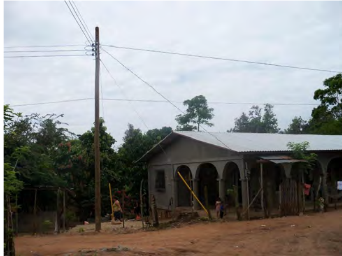
The new power poles