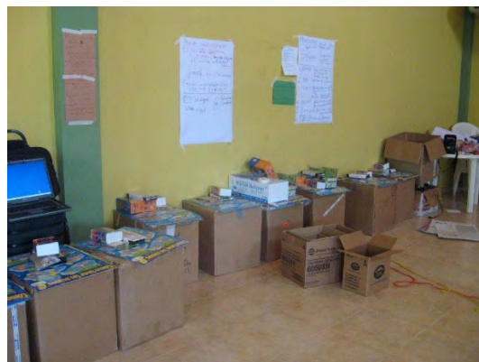
Boxes of new science equipment