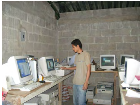
Being programmed in La Ceiba