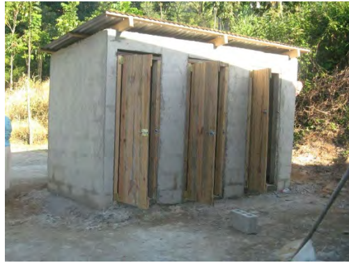
The new latrines