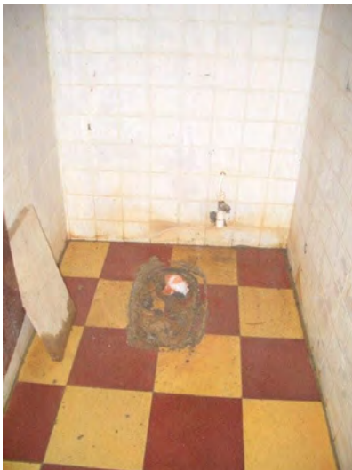
The old bathroom