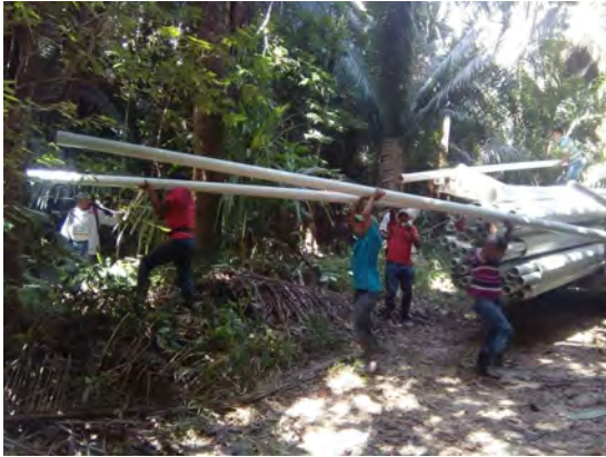
Taking pipeline up to dam 8 kms