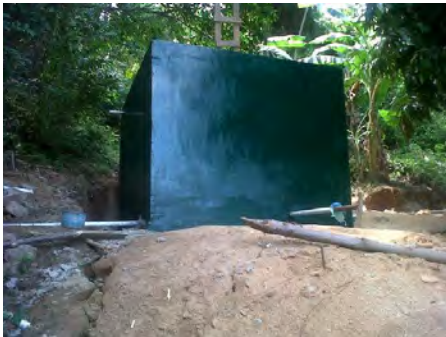
The new clean water tank

Built three water tanks with chlorination system