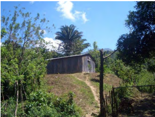
The old school

Replaced an old barnboard school with a new one classroom school