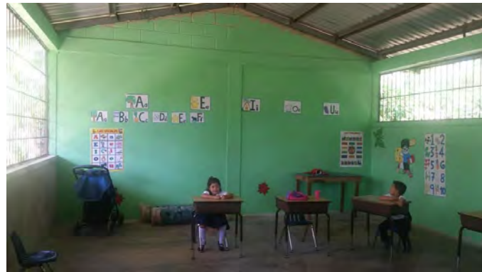
The finished paint job