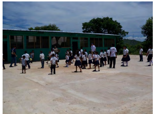
The new playground