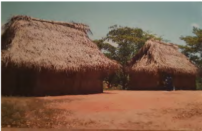
The old classrooms