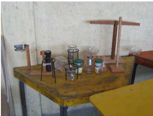
Old science equipment in April the 18 th