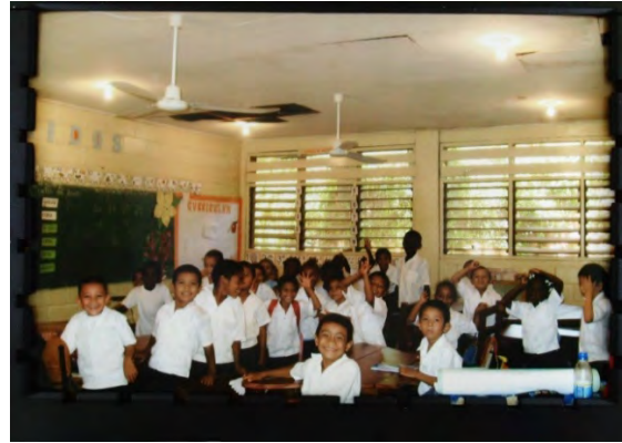
A lit classroom