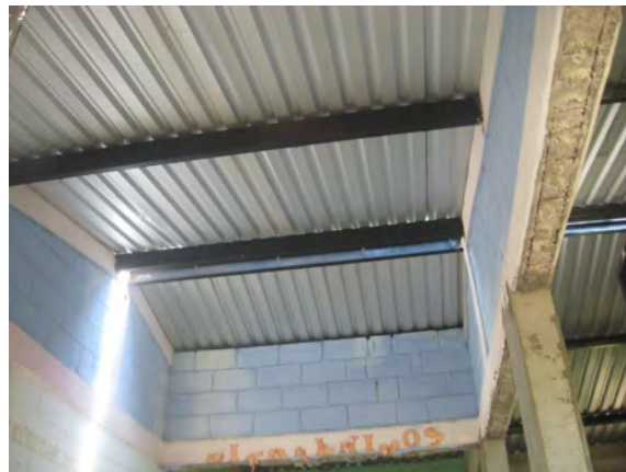
The new roof