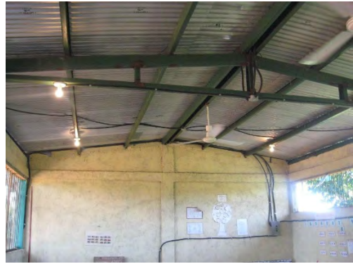
Electricity in the school