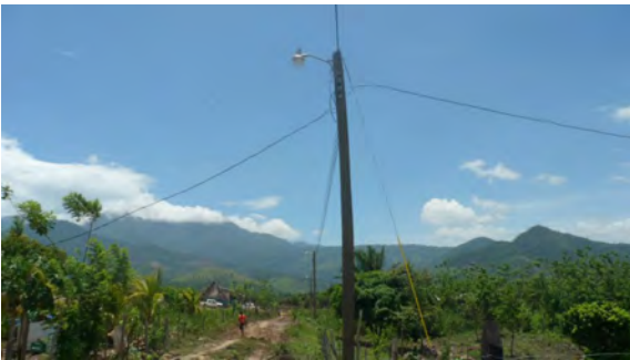
The new power pole near school