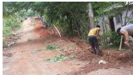
Installing distribution line