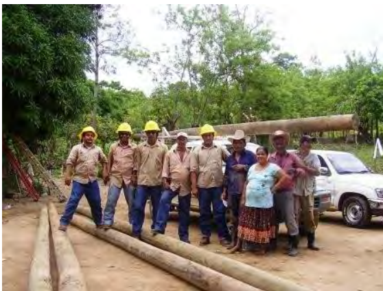
The power company on the job

Brought power to the 30 homes, tiendas and school