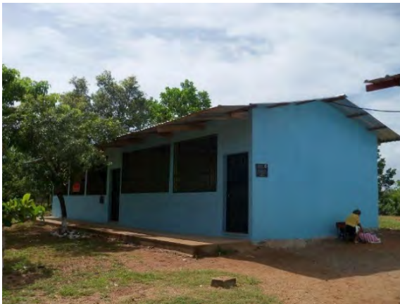
The two new classrooms