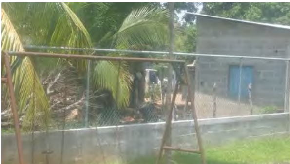
We provided the fencing