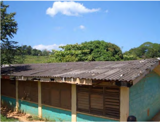
The old roof

Repaired roof, repainted, replaced 8 toilets, rewired