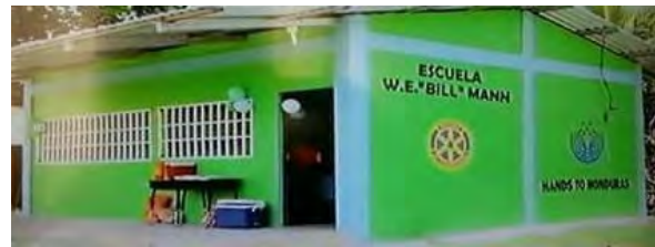
The new school