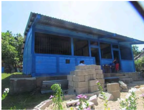
The school with new classroom on right

Added a classroom, brought electricity to the school, replaced the asbestos roof, painted the whole school