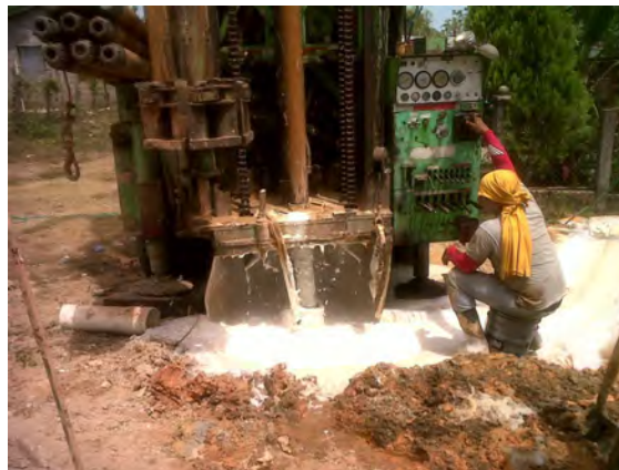
The new well

Drilled a backup well to keep the sand wet during the dry season