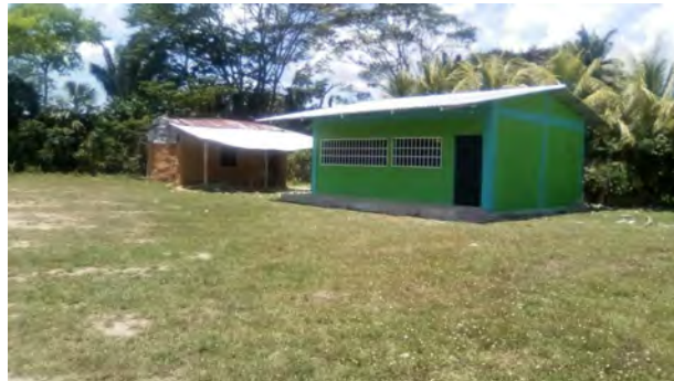
The old and new together