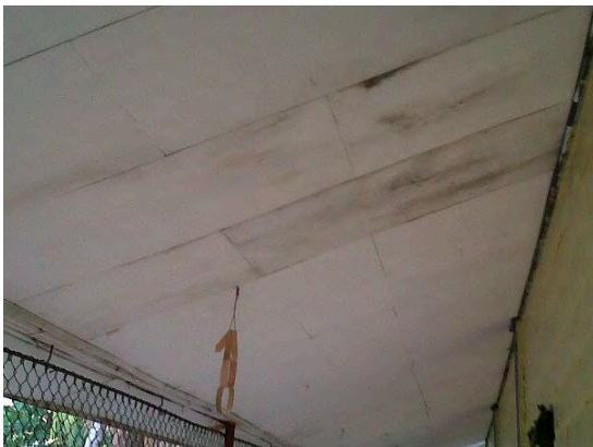
Moldy, water stained ceiling