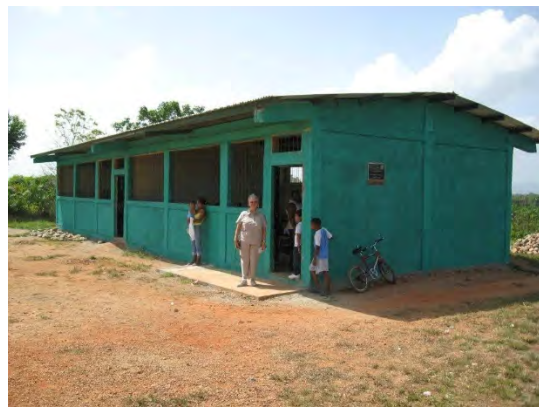
The new school