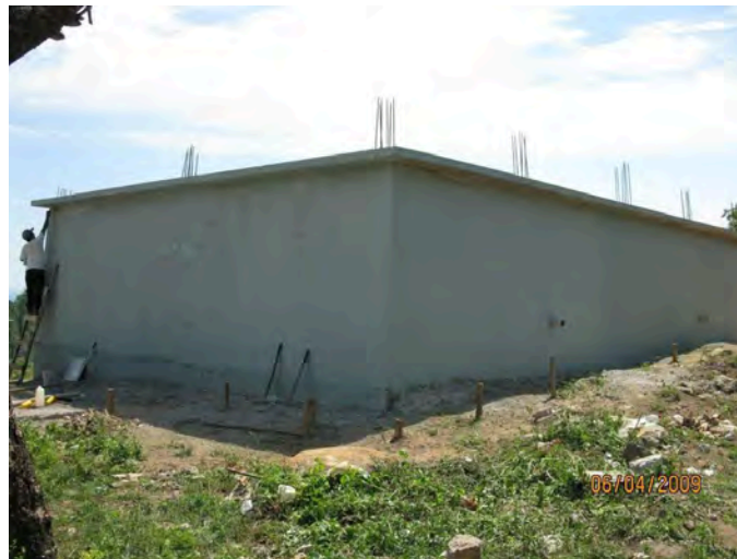
The river water tank