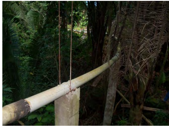
The pipeline going to the tanks